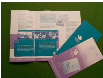
D. DL Pamphlets (pack of 30)