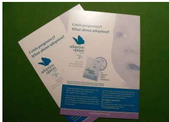
C. A3 Posters (pack of 2)