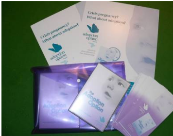
B. Pack of 2 DVDs, 2 posters and 30 pamphlets